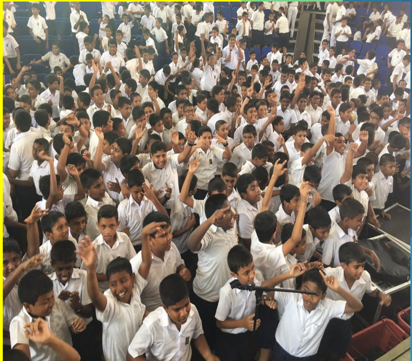
Mini SAGA at the Ticket launch for the 10 th , at MAS Arena