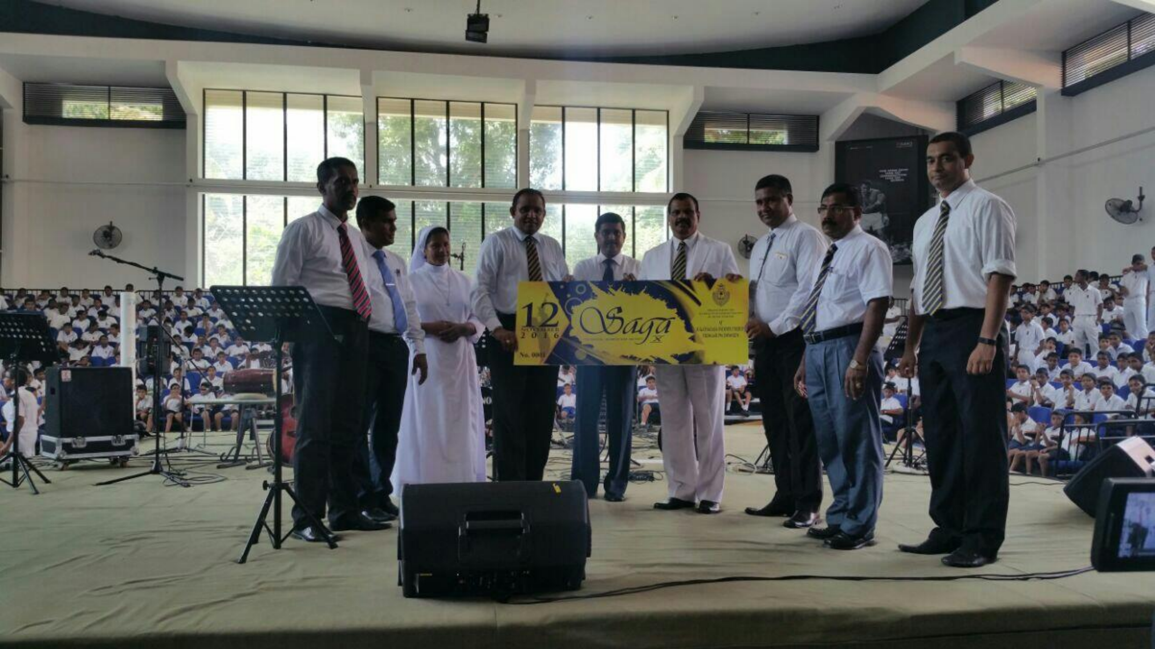
SAGA Ticket launch for the 10 th anniversary show